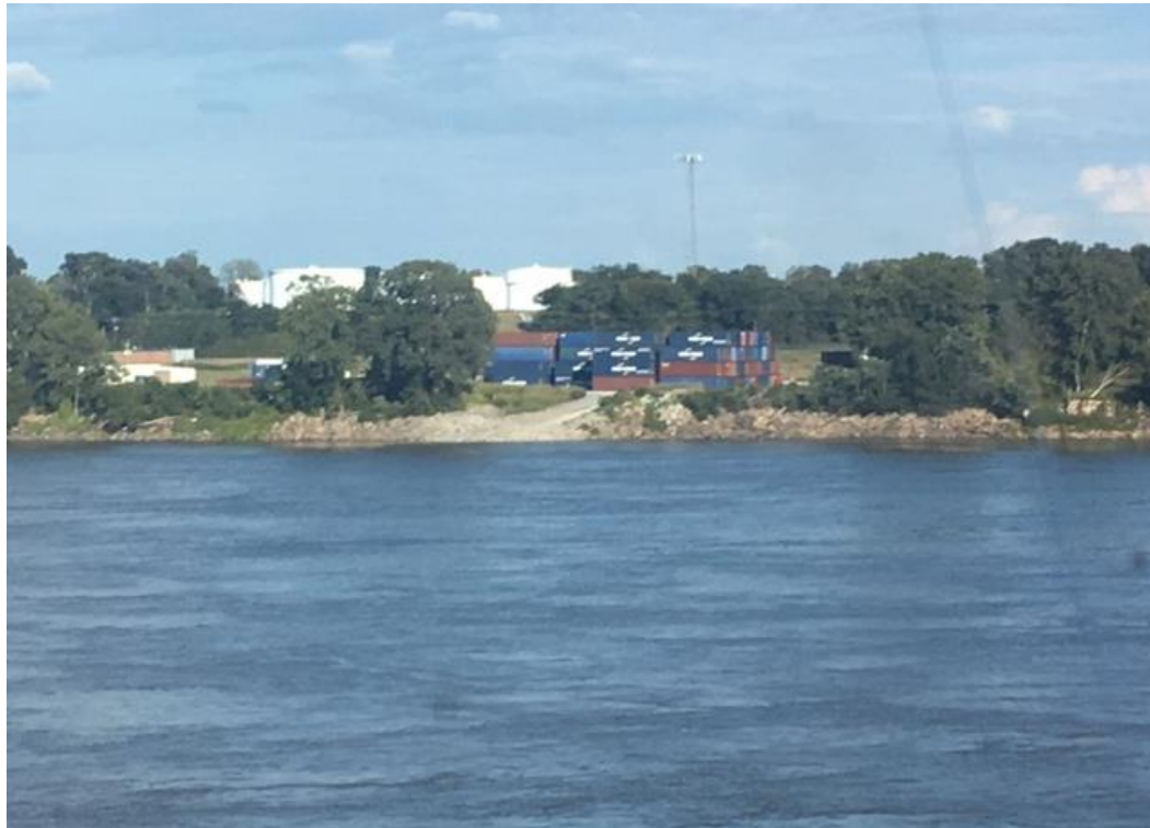
Seacor in Memphis