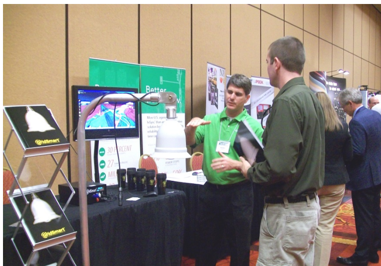
Vendor Booth Area

The TSITE Spring Meeting was the first Vendor Day event, where a vendor booth area was available for 17 vendors. Several vendors also provided technical presentations. Lunch was served in the vendor booth area, and a door prize slip was given to each attendee. As the attendees visited each booth, the vendor would mark their slip. An