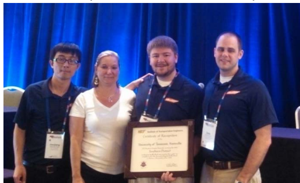
UT Traffic Bowl Team

The TSITE Winter meeting is held annually at one of the five universities, in conjunction with the annual TSITE Traffic Bowl. In 2013, the meeting was held at the University of Tennessee. TSITE also reimburses each of the student chapters for their travel expenses to the Winter meeting, to encourage participation in the TSITE Traffic Bowl. The University of Tennessee won the TSITE Traffic Bowl in 2013, which earned the right to represent TSITE at the SDITE Traffic Bowl. UT also won the SDITE Traffic Bowl, and thus advanced to the International Traffic Bowl at the ITE Annual Meeting in Boston. UT advanced to the final round, where they finished as runner-up, only losing to the University of Florida by one point! TSITE is