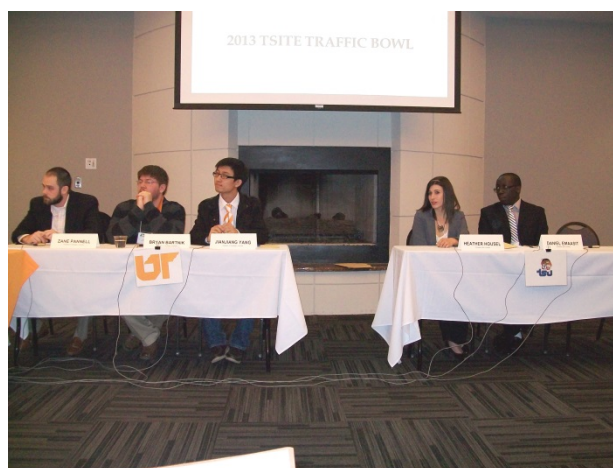
TSITE Traffic Bowl

The TSITE Winter Meeting is hosted every year by a TSITE Student Chapter to coincide with the annual TSITE Traffic Bowl competition. In 2013, The University of Tennessee hosted the meeting at the UT Visitor's Center. Teams from four of the five student chapters competed for the honor of representing TSITE in the SDITE Traffic Bowl. These teams included Vanderbilt University, University of Memphis, University of Tennessee, and Tennessee State University. The team from the University of Tennessee won the competition, and subsequently represented TSITE at the SDITE Traffic Bowl, where they also won.