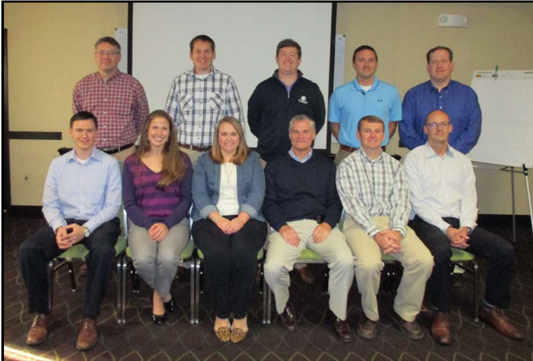
2014 TSITE Leadership Class:

TSITE sponsored another session of the SDITE Leadership Training Program in the Fall of 2014 to a group of 11 TSITE members. Altogether there have been 35 TSITE members that have received the training as 2014's group joins the 12 students trained in both 2011 and 2012. The feedback received from participants on this program has been tremendous and TSITE will continue to explore providing this opportunity in the future.